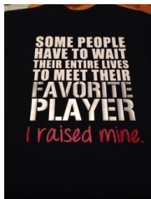
I Raised Mine Shirt (Back)