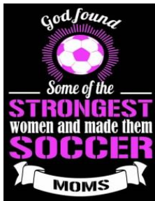
Strongest MOMS Shirt (Front)