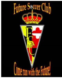
FSC LOGO Shirt (Front)

The Spirit Gear below is available for purchase: